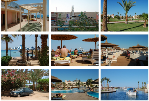
One day the Dana Beach Resort will be one of the older resorts. Workers are moving in. At the delivery made elements of the city appear.