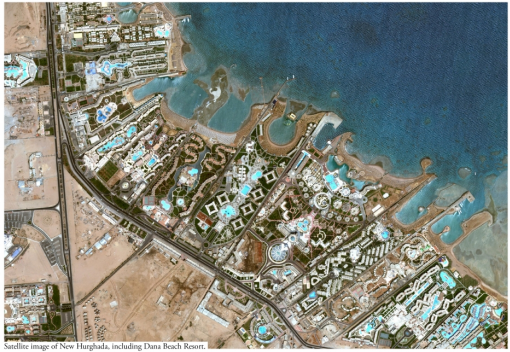
Satellite image of New Hurgada, including Dana Beach Resort.