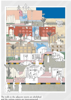
The walls to the adjacent resorts are abolished and the various resorts are interconnected.