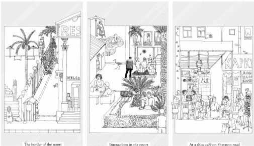
The border of the resort