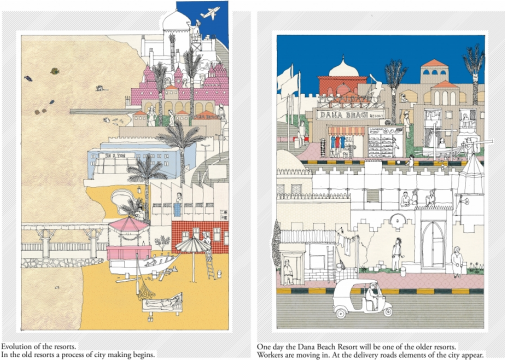
Evolution of the resorts. In the old resorts a process of city making begins.