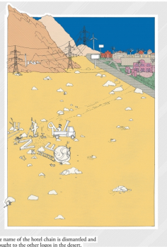
The name of the hotel chain is dismantled and brought to the other legs in the desert.