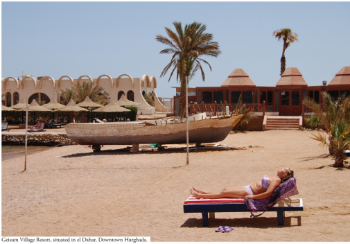
Getem Village Resort, situated in el Dahar, Downtown Hurgada.