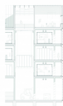
basement & subterranean